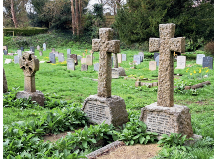
Top: St Peter's, Knowl Hill Bottom: Wargrave Chalkpit Cemetery