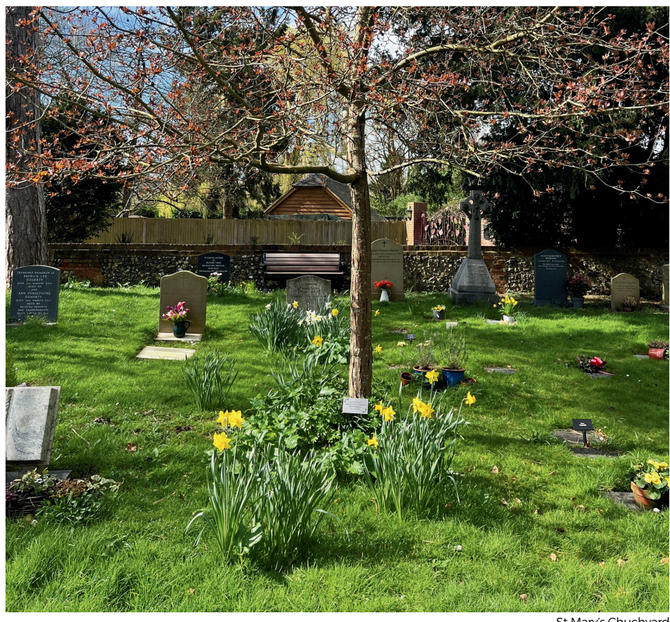
St Mary's Chuchyard

Our churchyards and cemetery are not just where our loved ones are interred, but are peaceful places where the wilding zones encourage new life to be fostered. Over the last few years, flowers and insects have flourished. Life is not neat, and all God's creation cannot be constrained in neat lines. We see amongst death, God's creation, and as all the biodiversity proliferates, we give praise to God for all his gifts to us.